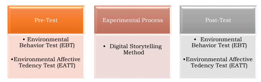
Figure 4. Working Group

Two different tests were applied to the experimental and control groups in order to determine the effect of using digital storytelling in 'Human and Environment' unit education on affective disposition and behaviour perception towards the environment. These are; Environmental Behaviour Test (EBT) and Environmental Affective Tendency Test (EATT). These tests were applied to both experimental and control groups before the experimental procedure. During the experimental process; while the constructivist approach supported by digital storytelling method was applied to the experimental group, the activities in the textbooks prepared within the framework of the curriculum were applied to the control group. At the end of the experimental process, EBT and EATT, which were previously applied to the control and experimental group students, were applied again as a post-test and data were collected.