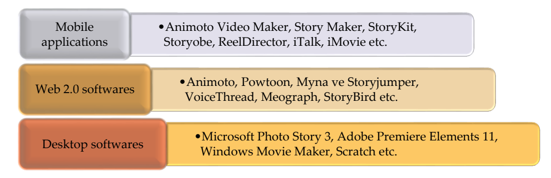
Figure 1. Digital Story Software

In addition to the aforementioned software, one can create the image scenes to be used in the storyboard by drawing them oneself (Balaman, 2016), or design them from image design applications (toondoo, glogster, bitstrips, bitmoji, powtoon, animato, creaza, goanimate) (Uslupehlivan & Kurtoğlu Erden, 2016). To create a digital story, it is necessary to follow the steps (Barret, 2009; Tolisano, 2008) in Figure 2 below.