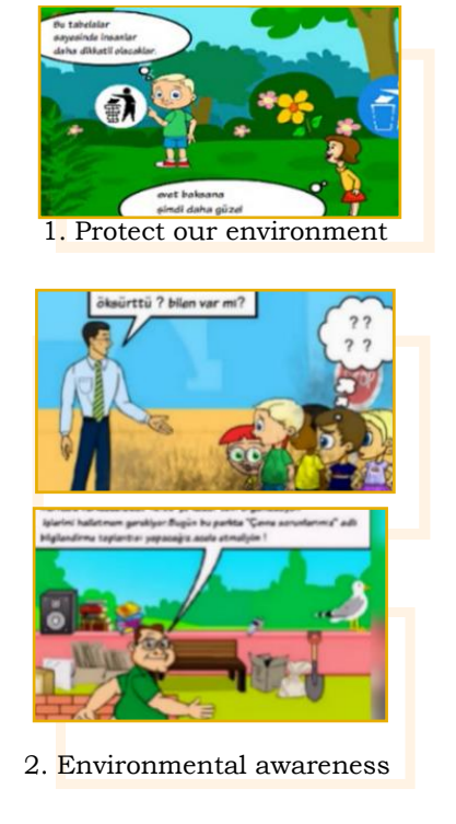
Appendix 1. Excerpts from the Digital Stories Used